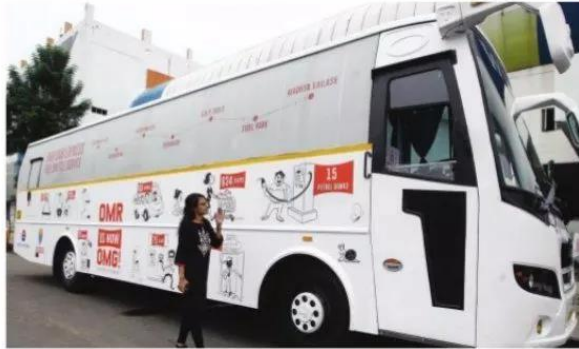
മദ്രാസ് ഡെ ആഘോഷവുമായി ബന്ധപ്പെട്ട് ഓരംഡ് മഹാബലി റോഡിലൂടെ പ്രധാനസ്ഥലങ്ങൾ സന്ദർശിക്കാനായി സൗജന്യ സർവീസ് നടത്തുന്ന എ.സി. ബസ്

മധ്യകൈലാസ് ക്ഷേത്രം, ബക്കിങ് കനാൽ, 1916-ൽ സ്ഥാപിച്ച വള്ളങ്ങരി ഫെൽത്ത് സെന്റർ, ബ്രോഡ്വേയിൽ 1916 മുതൽ മദ്രാസിൽ പ്രവർത്തിക്കുകയും ഇപ്പോൾ അമ്മണിയിലേക്ക് മാറ്റുകയും ചെയ്ത സെന്റൽ പോളിടെക്നിക് സെന്റർ, അമ്മണിയിൽ തന്നെയുള്ള റോജ മുത്തയ്യ റിസർച്ച് ലൈബ്രറി, എം.എസ്. സ്വാമി നാഥൻ റിസർച്ച് ഫൗണ്ടേഷൻ, ഏഷ്യൻ കോളേജ് ഓഫ് ജേണലിസം, 1962-ൽ ജൈലാപ്പുരിൽ നൊബേൽസമ്മാനജേതാവ് സി. ചന്ദ്രശേഖരൻ ഉദ്ഘാടനം ചെയ്യുകയും പിന്നീട് അമ്മണിയിലേക്ക്