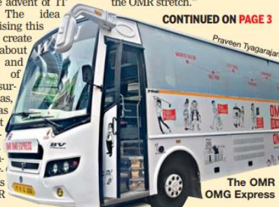
The OMR OMG Express

THE IDEA BEHIND ORGANISING THIS BUS TRIP IS TO CREATE AWARENESS ABOUT THE HISTORY AND DEVELOPMENT OF OMR AND ITS SURROUNDING AREAS. A BOOKLET CONTAINING INTERESTING FACTS ABOUT OMR AND AN AUDIO PRESENTATION WILL BE AVAILABLE TO THE PASSENGERS SO THAT THEY CAN UNDERSTAND THE IMPORTANCE OF THIS STRETCH