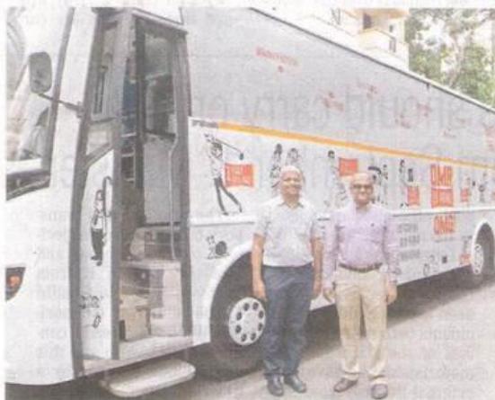
The OMROMG Express bus aims to show passengers little-known historic sites along the IT corridor

The bus will start from Madhya Kailash to Sholinganallur with five stops - Tidel Park, SRP Tools, Perungudi, Thoraipakkam and Karapak-