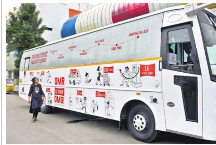
■ சென்னை தினத்தை முன்னிட்டு, தனியார் நிறுவனம் சார்பில் இயக்கப்படும் சிறப்பு பேருந்து.