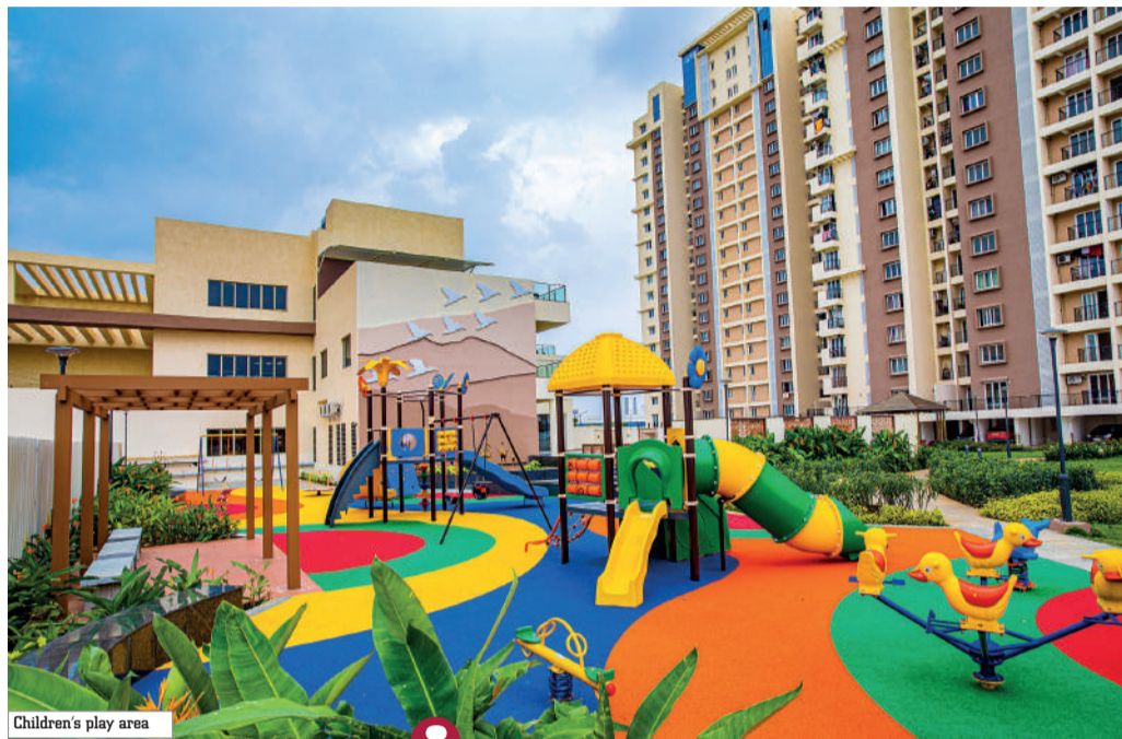
Children's play area

Located on the main road, a 300 ft. private passage shelters the residents from the hustle and bustle of OMR. Apart from being in the middle of a major IT hub, the project offers