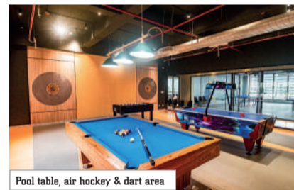
Pool table, air hockey & dart area