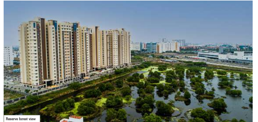
Reserve forest view

inable comfort is what is in store for you at Risington. With 1-BHK, 2-BHK, 2.5-BHK, 3-BHK and duplex, the project offers something for every requirement. Designed by the best of international and national consultants, built with the highest standards of quality and fitted with best in class specifications, the future-ready